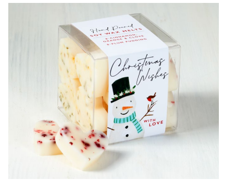
XW24-05 8 x CINNAMON, ORANGE & CLOVE