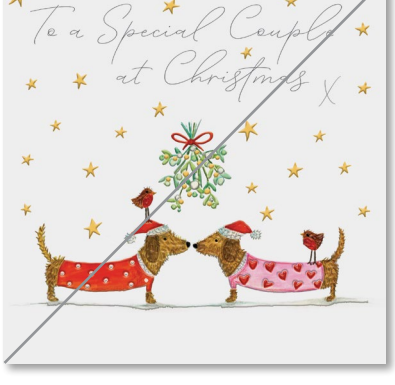
CW23 - Discontinued