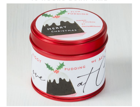
XC24-01 PLUM PUDDING