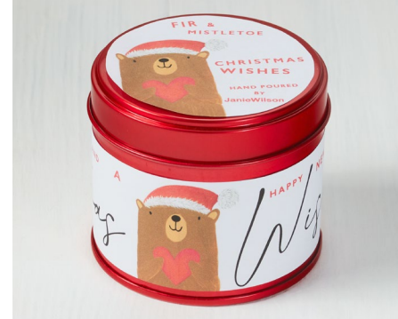
XC24-03 FIR & MISTLETOE