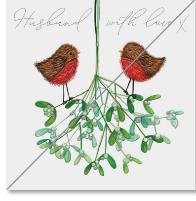
CW05 - Discontinued