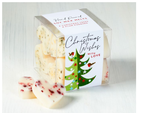
XW24-04 8 × CHRISTMAS TREES 8 × PLUM PUDDING