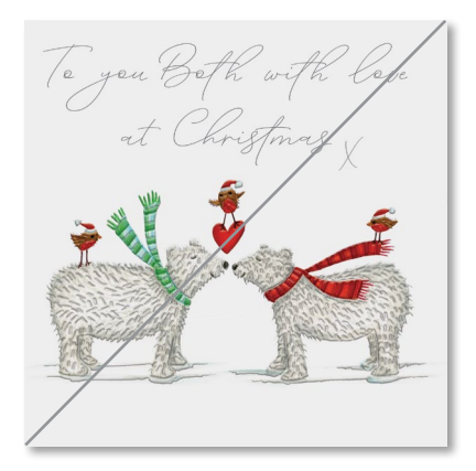
CW13 - Discontinued