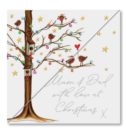
CW03 - Discontinued