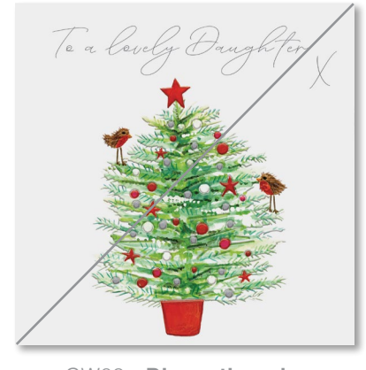
CW09 - Discontinued