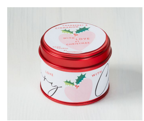
XCM24-05 CRANBERRY & CINNAMON