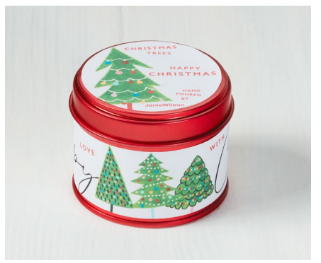
XCM24-02 CHRISTMAS TREES