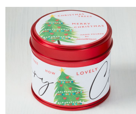
XC24-04 CHRISTMAS TREES