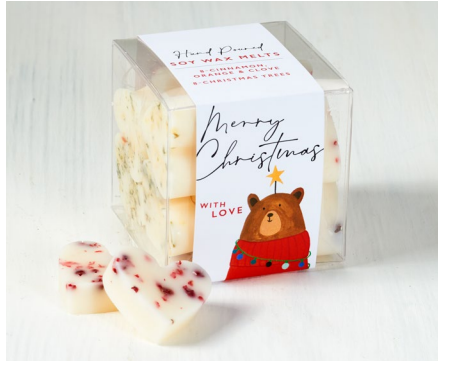
XW24-02 8 × CINNAMON, ORANGE & CLOVE 8 × CHRISTMAS TREES