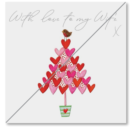
CW04 - Discontinued