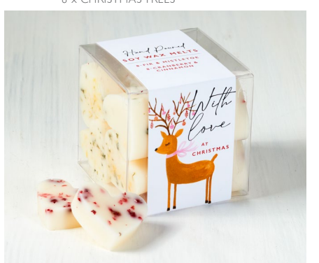
XW24-03 8 x FIR & MISTLETOE 8 x CRANBERRY & CINNAMON