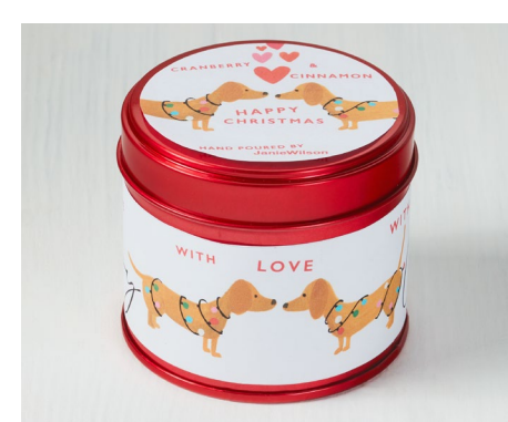
XC24-05 CRANBERRY & CINNAMON