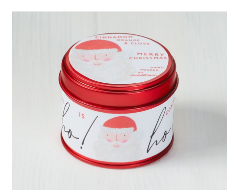
XCM24-04 CINNAMON, ORANGE & CLOVE