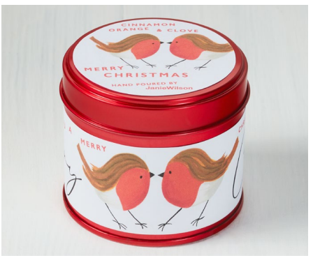
XC24-02 CINNAMON, ORANGE & CLOVE