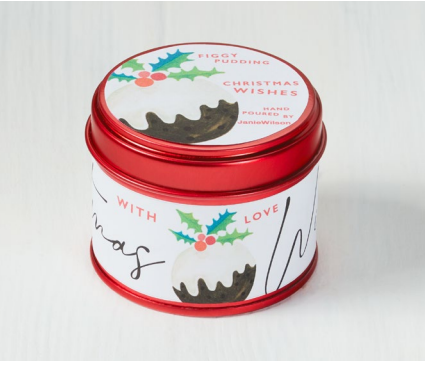
XCM24-03 FIGGY PUDDING