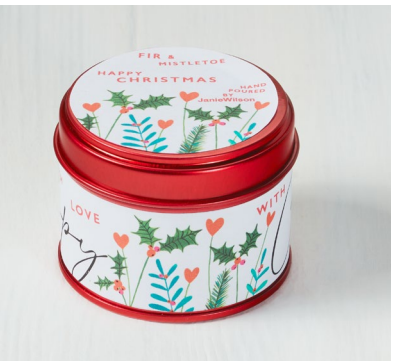
XCM24-01 FIR & MISTLETOE