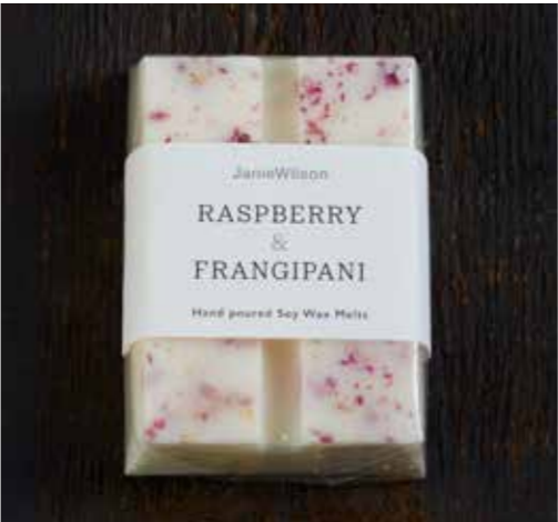
WM05 RASPBERRY & FRANGIPANI