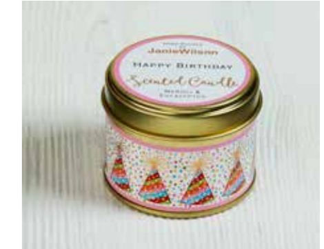
UNCM04 NEROLI & EUCALYPTUS