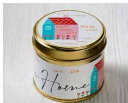
SRC04 WHITE FLOWERS