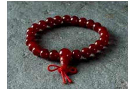
CARNELIAN Helps concentration and stimulates metabolism.