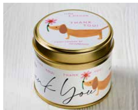
SRC02 LIME & MANGO