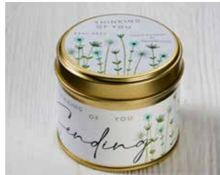
SRC05 EARL GREY