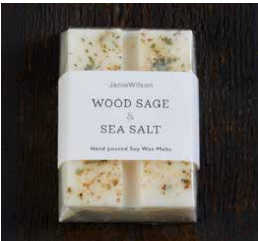
WM08 WOOD SAGE & SEA SALT

COMPLIMENTARY P.O.S. • 48 WAX MELTS BARS (6 FREE) • 6 GLASS WAX BURNERS • £163.50