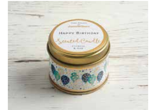
LACM02 - CYPRESS & OAK