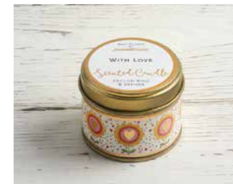
LACM07 - ENGLISH ROSE & VETIVER