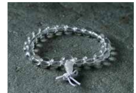
CLEAR QUARTZ Helps concentration.

COMPLIMENTARY P.O.S. • 15 CHIP BRACELETS • 15 POWER BRACELETS • 30 COTTON BAGS • £134.49