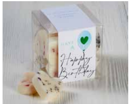
SRW05 8 x BLUEBERRY 8 x PEONY