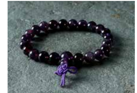
AMETHYST Helps will power and negative thoughts.