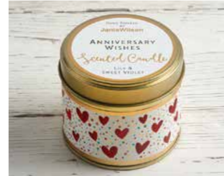
LAC02 - LILY & SWEET VIOLET