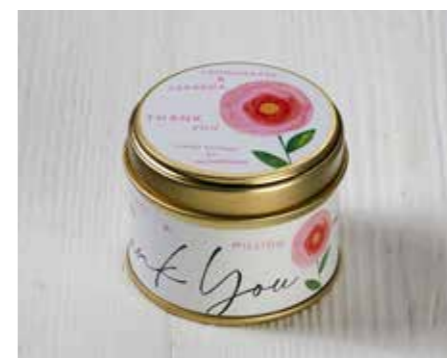
SRCM04 LEMONGRASS & VERBENA