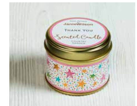
UNCM08 COUNTRY GARDEN