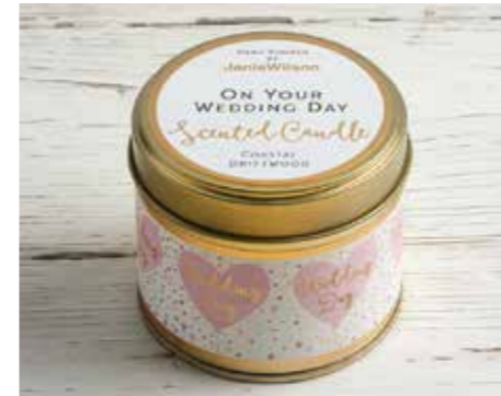
LAC01 - COASTAL DRIFTWOOD