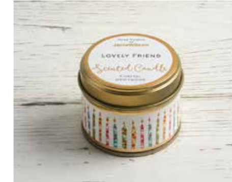
LACM03 - COASTAL DRIFTWOOD