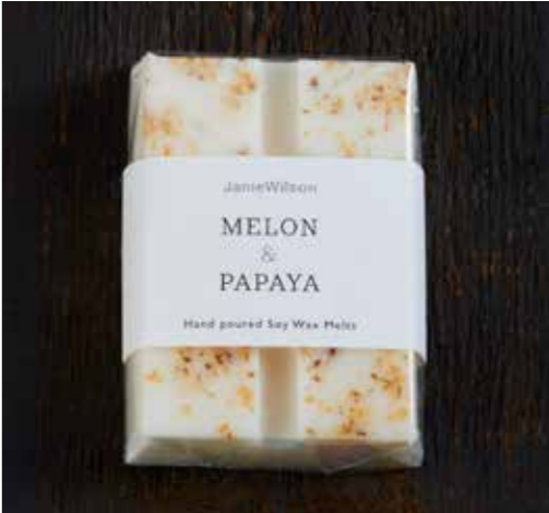
WM02 MELON & PAPAYA