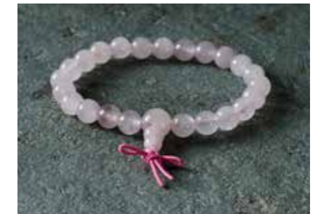
ROSE QUARTZ Helps to comfort and calm.