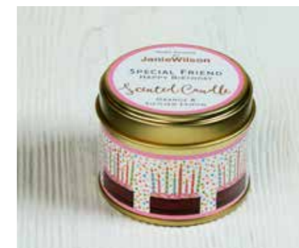
UNCM09 ORANGE & SICILIAN LEMON