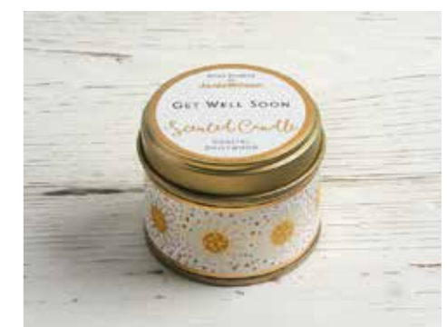
LACM10 - COASTAL DRIFTWOOD