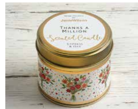
LAC04 - CYPRESS & OAK