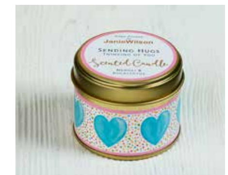
UNCM10 NEROLI & EUCALYPTUS