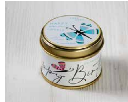
SRCM01 EARL GREY