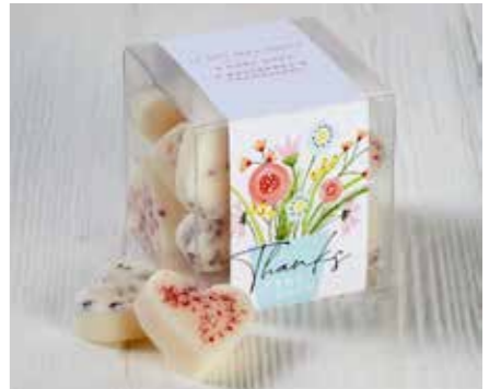
SRW03 8 x EARL GREY 8 x RASPBERRY & FRANGIPANI