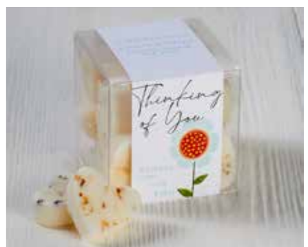
SRW04 8 x WHITE FLOWERS 8 x WOOD SAGE & SEA SALT