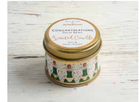
LACM06 - LILY & SWEET VIOLET