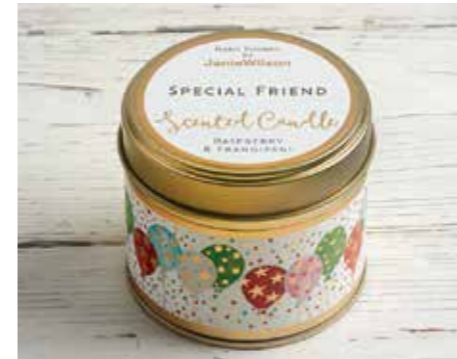
LAC03 - RASPBERRY & FRANGIPANI