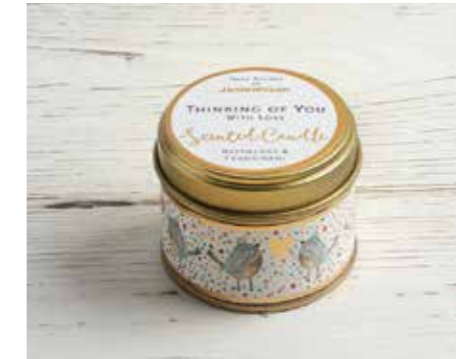
LACM05 - RASPBERRY & FRANGIPANI