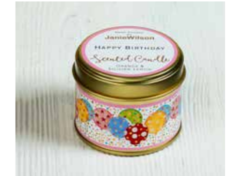
UNCM02 ORANGE & SICILIAN LEMON