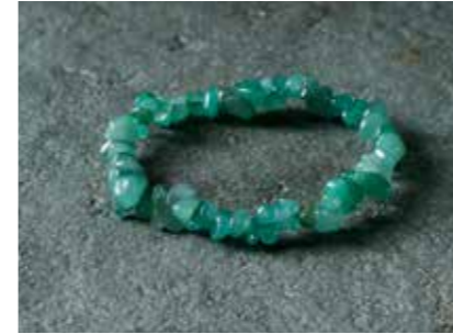
AVENTURINE Attracts luck and prosperity.

These are made up of small tumbled crystals. The chips are strung onto elastic to create a textured look of the natural form of the crystals.