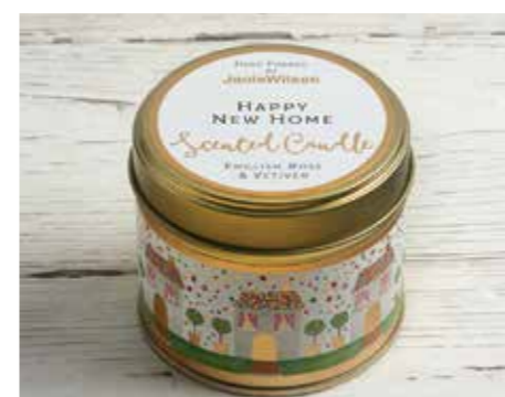
LAC05 - ENGLISH ROSE & VETIVER