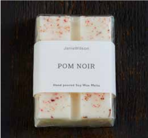
WM04 POM NOIR