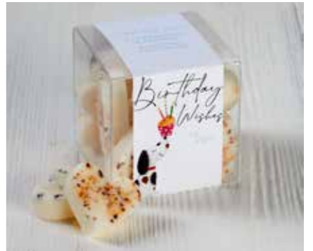
SRW01 8 x LEMONGRASS & VERBENA 8 x COASTAL DRIFTWOOD