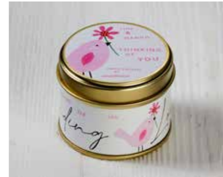
SRCM03 LIME & MANGO