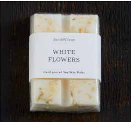
WM07 WHITE FLOWERS