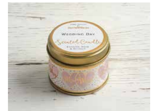
LACM08 - ENGLISH ROSE & VETIVER