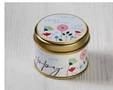
SRCM02 WHITE FLOWERS