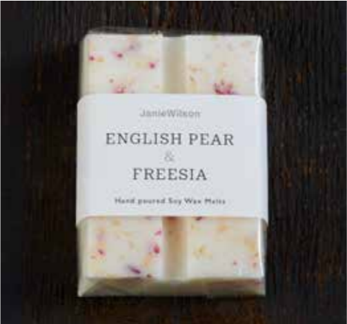
WM01 ENGLISH PEAR & FREESIA

All wax melt bars are available separately and supplied in 6's. The package includes all 8 fragrances, 6 of each.