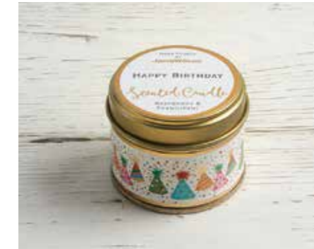
LACM01 - RASPBERRY & FRANGIPANI