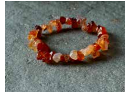
CARNELIAN Helps concentration and stimulates metabolism.