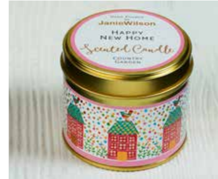
UNC02 COUNTRY GARDEN