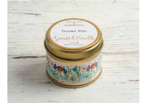
LACM04 - LILY & SWEET VIOLET