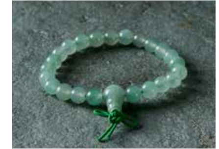
AVENTURINE Attracts luck and prosperity.

The semi-precious stone is carved into spheres to create a perfectly round bead, and joined together with elastic.