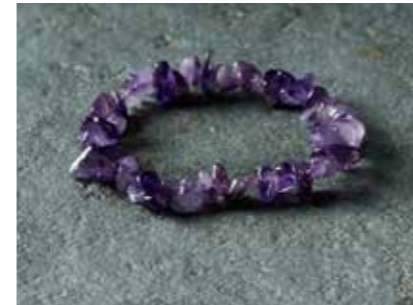
AMETHYST Helps will power and negative thoughts.