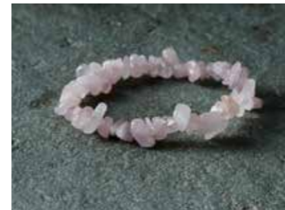
ROSE QUARTZ Helps to comfort and calm.