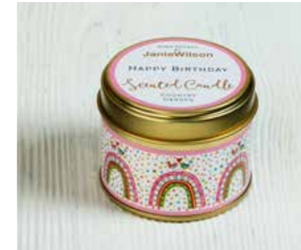
UNCM01 COUNTRY GARDEN