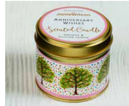
UNC03 ORANGE & SICILIAN LEMON