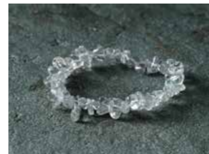
CLEAR QUARTZ Helps concentration.