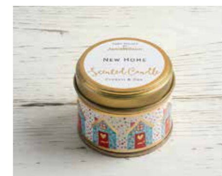
LACM09 - CYPRESS & OAK