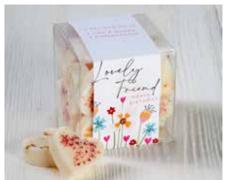
SRW02 8 x LIME & MANGO 8 x POMEGRANATE