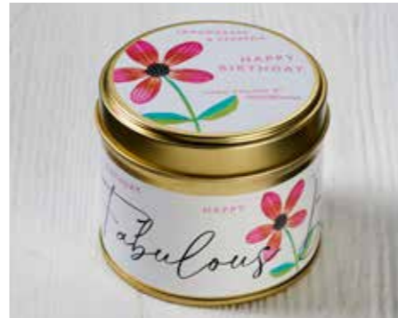
SRC01 LEMONGRASS & VERBENA