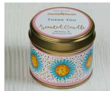
UNC05 NEROLI & EUCALYPTUS