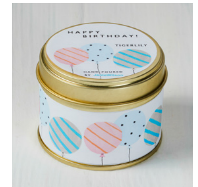
TCM06 TIGER LILY