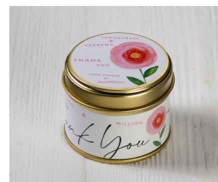
SRM04 LEMONGRASS & VERBENA