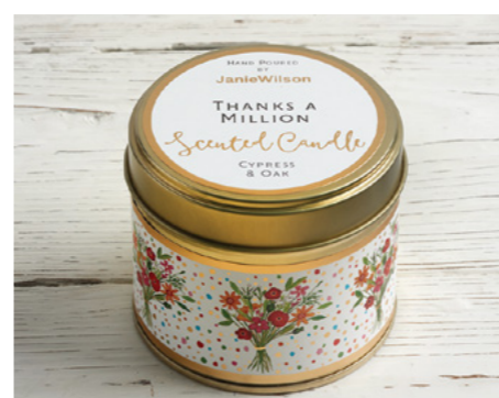
LAC04 – CYPRESS & OAK