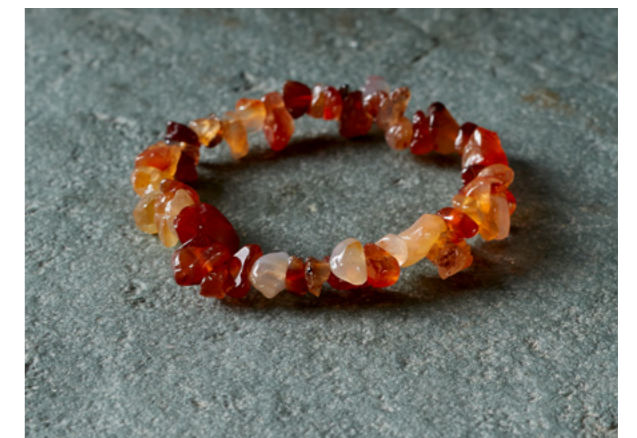
CARNELIAN Helps concentration and stimulates metabolism.