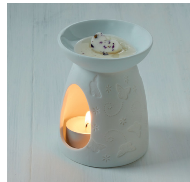
WMB-05 BUTTERFLY BURNER 122MM H X 95MM W