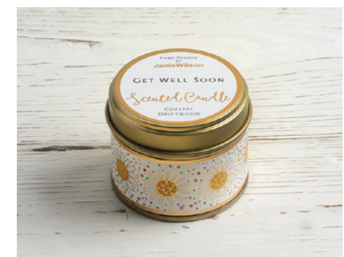
LACM10 – COASTAL DRIFTWOOD