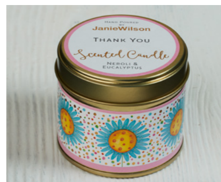
UNC05 NEROLI & EUCALYPTUS