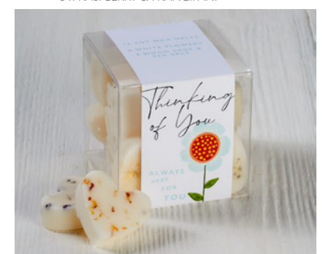
SRW04 8 x WHITE FLOWERS 8 x WOOD SAGE & SEA SALT