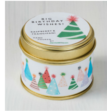
TCM01 RASPBERRY & FRANGIPANI

All designs are available separately and supplied in 6's. There are 12 designs available.