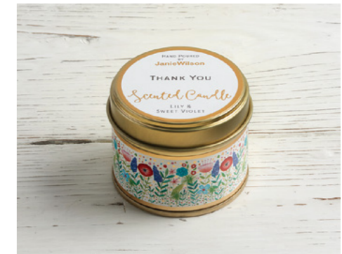
LACM04 – LILY & SWEET VIOLET - Discontinued