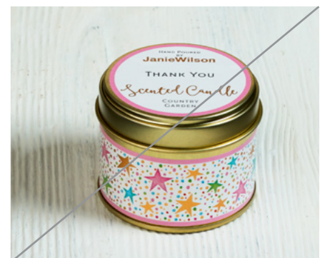
UNCM08 COUNTRY GARDEN - Discontinued