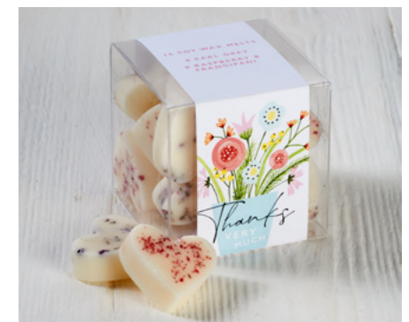
SRW03 8 x EARL GREY 8 x RASPBERRY & FRANGIPANI