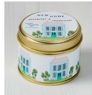
TCM04 RASPBERRY & FRANGIPANI