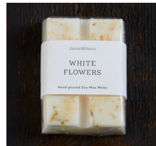
WM07 WHITE FLOWERS