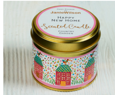
UNC02 COUNTRY GARDEN