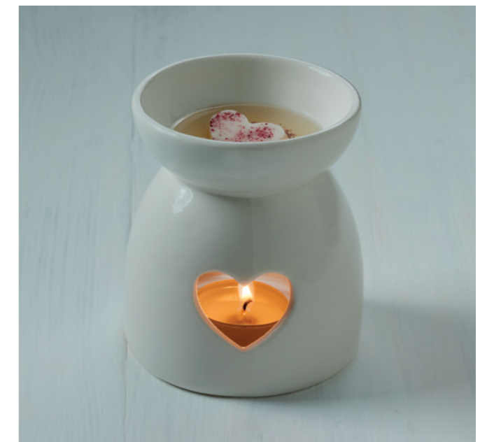
WMB-04 HEART CUT OUT BURNER 110MM H X 90MM W