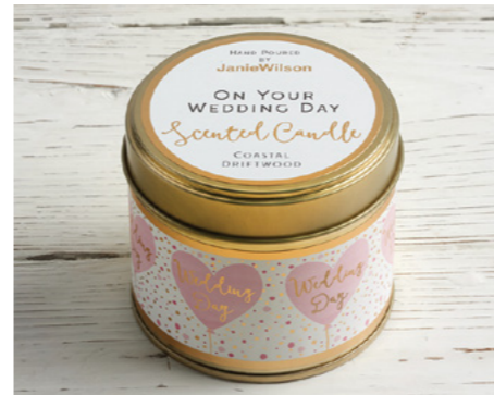
LAC01 – COASTAL DRIFTWOOD