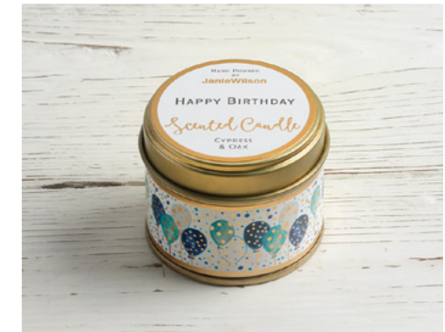
LACM02 – CYPRESS & OAK