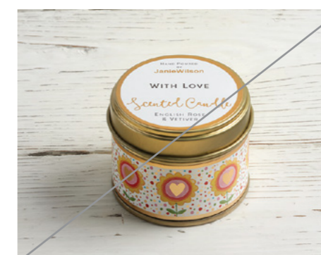
LACM07 – ENGLISH ROSE & VETIVER - Discontinued