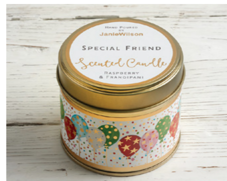
LAC03 – RASPBERRY & FRANGIPANI