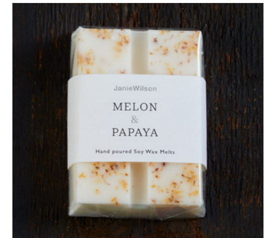
WM02 MELON & PAPAYA