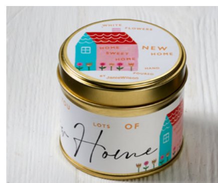
SRC04 WHITE FLOWERS