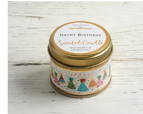
LACM01 – RASPBERRY & FRANGIPANI