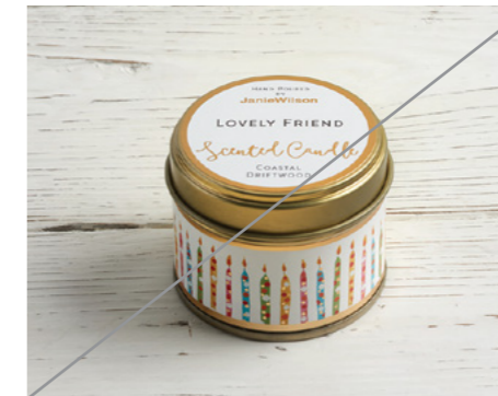
LACM03 – COASTAL DRIFTWOOD - Discontinued