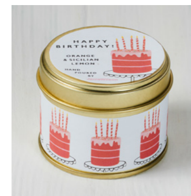
TCM11 ORANGE & SICILIAN LEMON