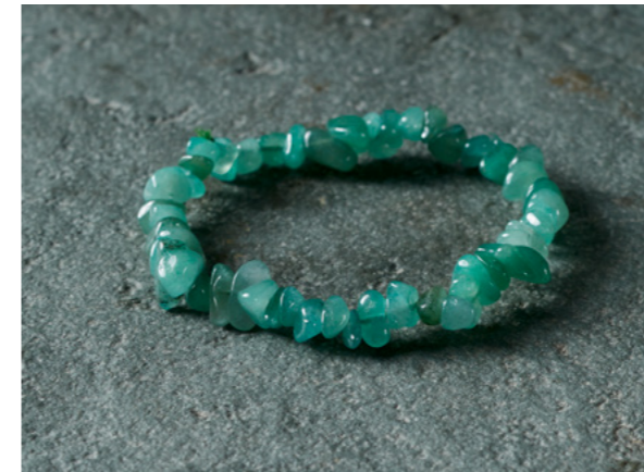
AVENTURINE Attracts luck and prosperity.

These are made up of small tumbled crystals. The chips are strung onto elastic to create a textured look of the natural form of the crystals.