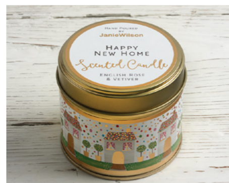
LAC05 – ENGLISH ROSE & VETIVER