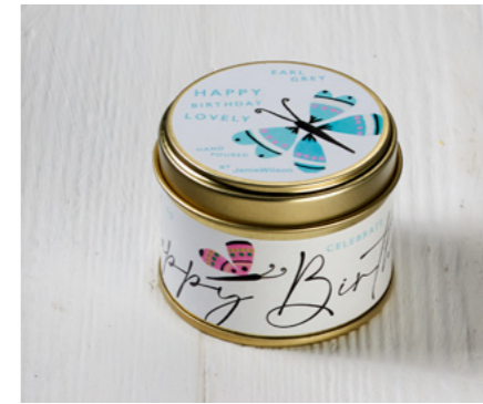
SRM01 EARL GREY