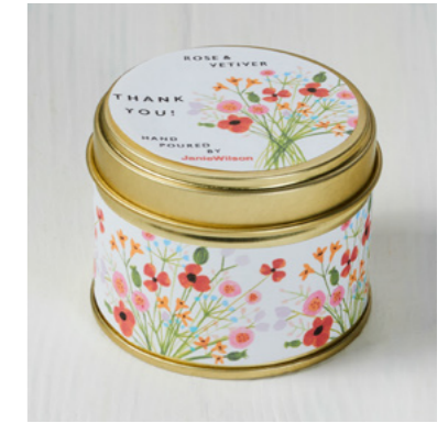
TCM03 ROSE & VETIVER