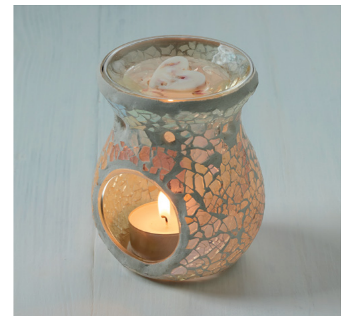
WMB-06 CRACKLE MOSAIC BURNER 110MM H X 90MM W