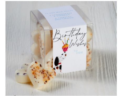
SRW01 8 x LEMONGRASS & VERBENA 8 x COASTAL DRIFTWOOD