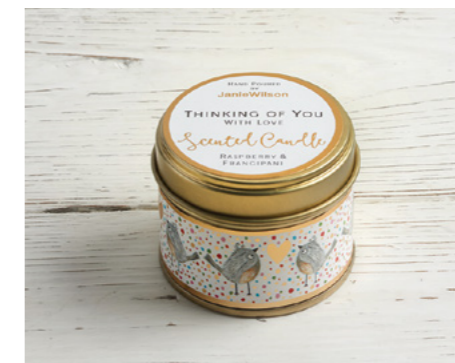
LACM05 – RASPBERRY & FRANGIPANI