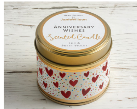
LAC02 – LILY & SWEET VIOLET