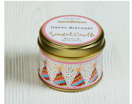
UNCM04 NEROLI & EUCALYPTUS