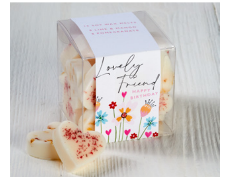
SRW02 8 x LIME & MANGO 8 x POMEGRANATE