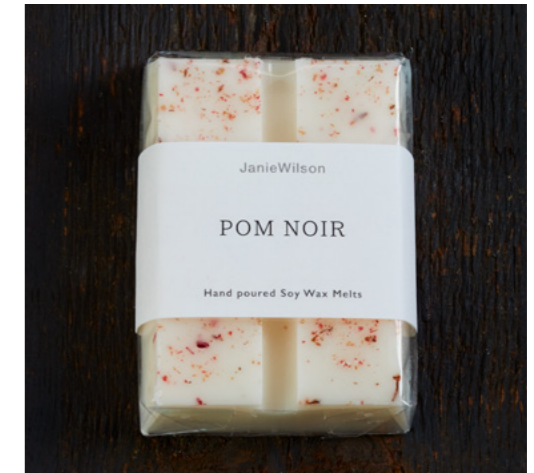
WM04 POM NOIR