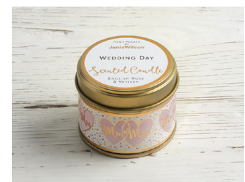
LACM08 – ENGLISH ROSE & VETIVER