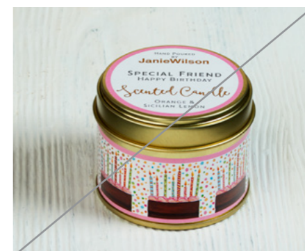
UNCM09 ORANGE & SICILIAN LEMON - Discontinued