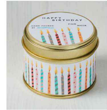
TCM02 POM NOIR