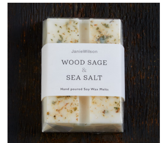
WM08 WOOD SAGE & SEA SALT