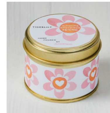
TCM08 TIGER LILY