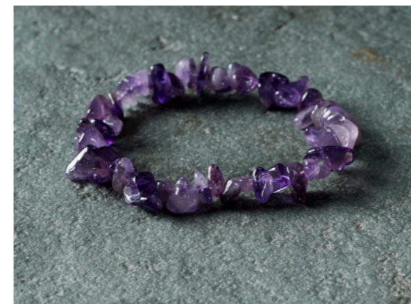
AMETHYST Helps will power and negative thoughts.