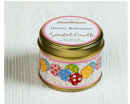
UNCM02 ORANGE & SICILIAN LEMON