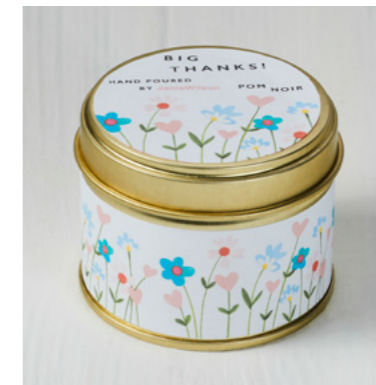
TCM05 POM NOIR