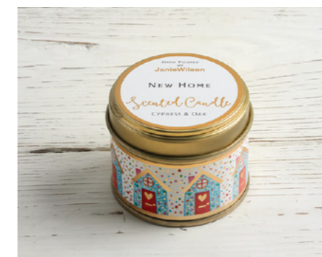
LACM09 – CYPRESS & OAK