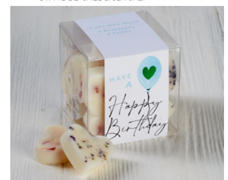
SRW05 8 x BLUEBERRY 8 x PEONY