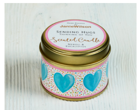
UNCM10 NEROLI & EUCALYPTUS