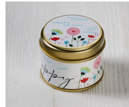
SRM02 WHITE FLOWERS