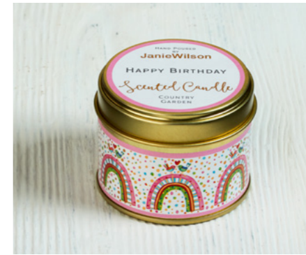
UNCM01 COUNTRY GARDEN