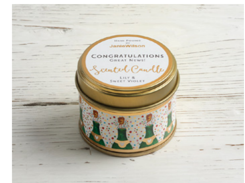
LACM06 – LILY & SWEET VIOLET