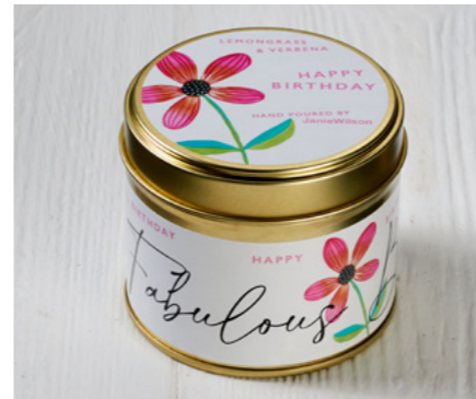
SRC01 LEMONGRASS & VERBENA