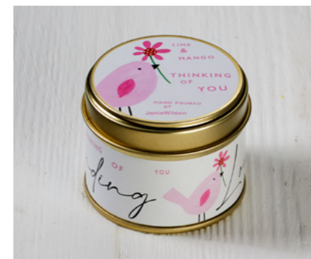
SRM03 LIME & MANGO