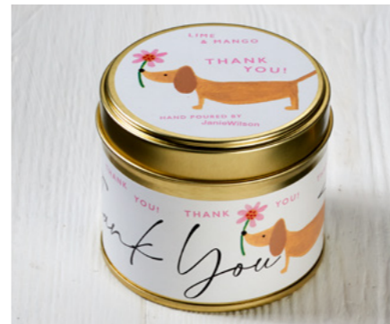
SRC02 LIME & MANGO