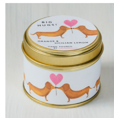
TCM10 ORANGE & SICILIAN LEMON