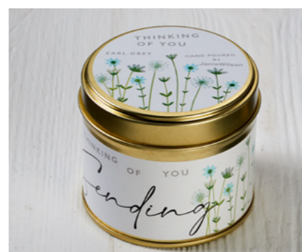
SRC05 EARL GREY