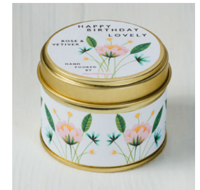
TCM09 ROSE & VETIVER