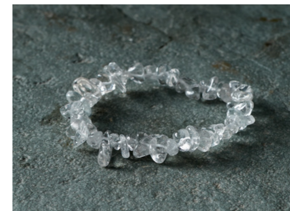
CLEAR QUARTZ Helps concentration.