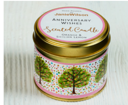
UNC03 ORANGE & SICILIAN LEMON