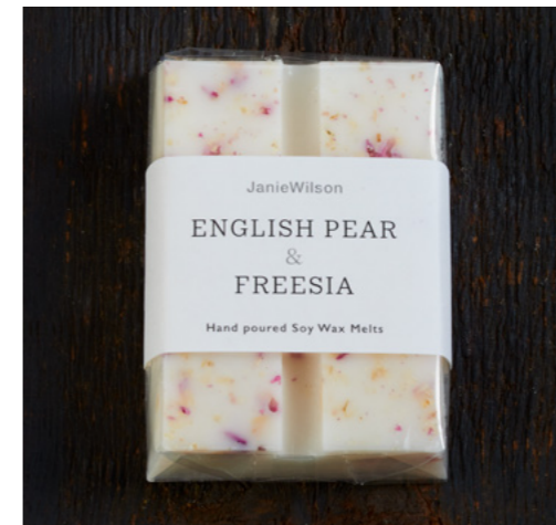
WM01 ENGLISH PEAR & FREESIA

All wax melt bars are available separately and supplied in 6's. The package includes all 8 fragrances, 6 of each.