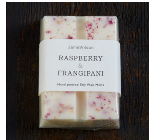
WM05 RASPBERRY & FRANGIPANI