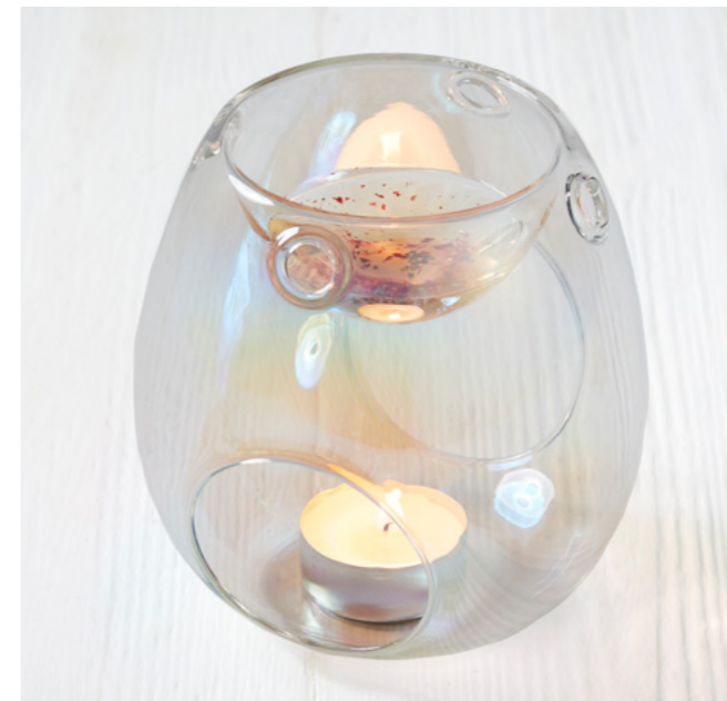
WMB-01 GLASS BURNER 120MM H X 110MM W