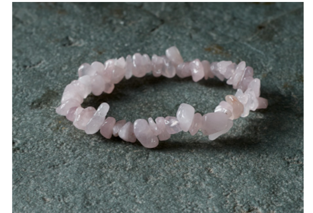
ROSE QUARTZ Helps to comfort and calm.